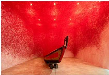
SHIOTA Chiharu, Memory of Water, 2021, Towada Art Center ©JASPAR, Tokyo, 2026 and Chiharu Shiota