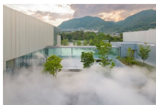
NAKAYA Fujiko, Dynamic Earth Series I, Fog Sculpture #47610, 2021, Nagano Prefectural Art Museum ©Fujiko Nakaya ©Nagano Prefectural Art Museum