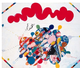
YAMAZAKI Tsuruko, Work, 1963, Hyogo Prefectural Museum of Art (The Yamamura Collection) ©Estate of Tsuruko Yamazaki, courtesy of LADS Gallery, Osaka and Take Ninagawa, Tokyo