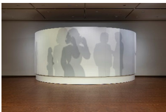
TAKAMATSU Jiro, Shadow, 1977, The National Museum of Art, Osaka ©The Estate of Jiro Takamatsu, Courtesy of Yumiko Chiba Associates, Tokyo, Pace Gallery, New York and Stephen Friedman Gallery, London. Photo: Fukunaga Kazuo