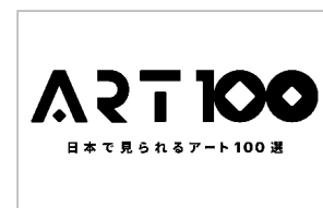
Logo for 100 Must-see Artworks in Japan